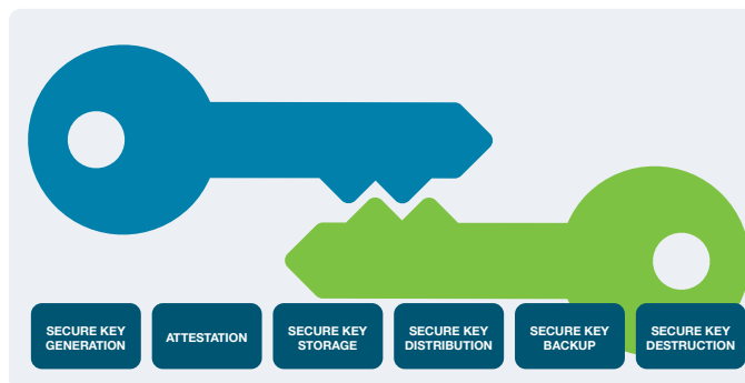
Securing the Cryptographic Key Lifecycle